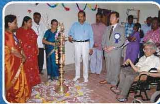
Inauguration function of Hostel for physically challenged girls