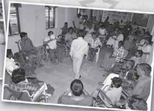
Games for the spinal injured 2