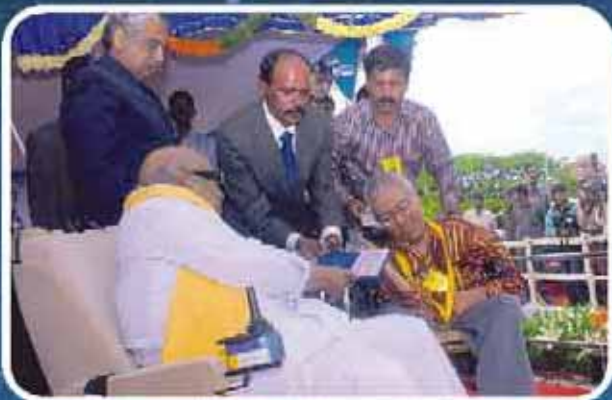
State award for ASSA - 2009