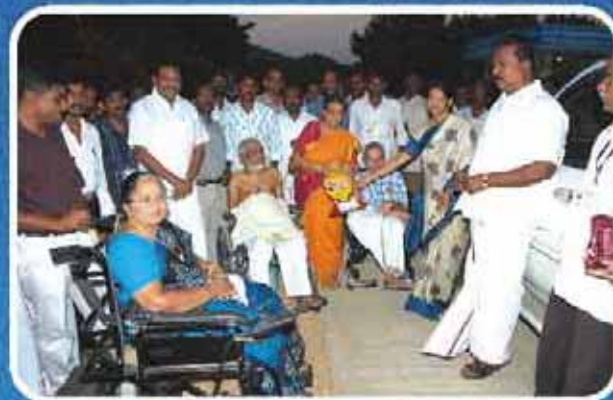
Kavignar Kanimozhi visit