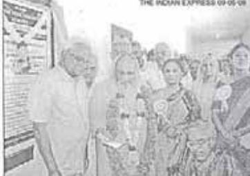
Sri Swami Dayananda Saraswati inaugurating the centre for special education at Amar Seva Sangam at Ayikudi in Tirunelveli district on Friday.