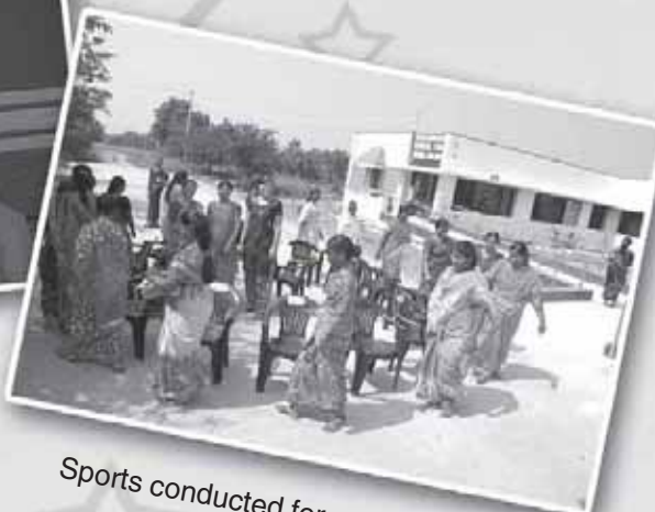
Sports conducted for parents of the special children