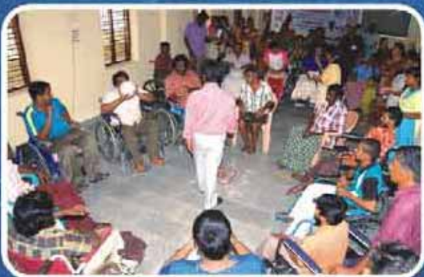
Games for the spinal injured