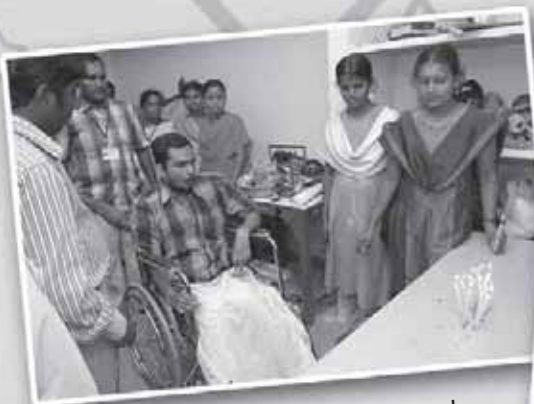
Games for the spinal injured