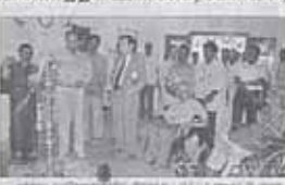
ஆய்க்குடி அமர்சேவா சங்கத்தில் உணவும், பெண்கள் தங்கும் விடுதி திறப்பு.

ஆய்க்குடி அமர்சேவா சங்கத்தில் உணவும், பெண்கள் தங்கும் விடுதி திறப்பு. இதுவரை கல்வித்தரத்தில் உட்கார்ந்து வந்திருந்த பெண்கள், இப்போது உணவும், தங்கும் விடுதி பெற்றுக் கொண்டுள்ளனர். இதுவரை கல்வித்தரத்தில் உட்கார்ந்து வந்திருந்த பெண்கள், இப்போது உணவும், தங்கும் விடுதி பெற்றுக் கொண்டுள்ளனர்.