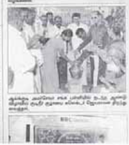
அமர்சேவா பள்ளி ஆண்டு விழா.

அமர்சேவா பள்ளி ஆண்டு விழா. இதுவரை கல்வித்தரத்தில் உட்கார்ந்து வந்திருந்த பெண்கள், இப்போது உணவும், தங்கும் விடுதி பெற்றுக் கொண்டுள்ளனர். இதுவரை கல்வித்தரத்தில் உட்கார்ந்து வந்திருந்த பெண்கள், இப்போது உணவும், தங்கும் விடுதி பெற்றுக் கொண்டுள்ளனர்.