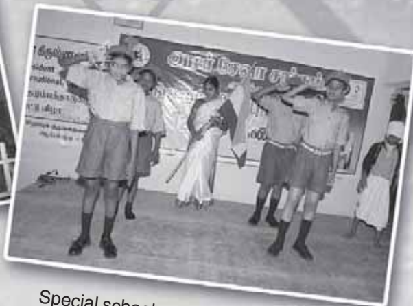
Special school annual day celebration