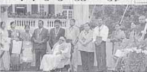
சாதனை படைத்தோருக்கு வீடுதகவன்: முதல்வர் வழங்கினார்.

சாதனை படைத்தோருக்கு வீடுதகவன்: முதல்வர் வழங்கினார். இதுவரை கல்வித்தரத்தில் உட்கார்ந்து வந்திருந்த பெண்கள், இப்போது உணவும், தங்கும் விடுதி பெற்றுக் கொண்டுள்ளனர். இதுவரை கல்வித்தரத்தில் உட்கார்ந்து வந்திருந்த பெண்கள், இப்போது உணவும், தங்கும் விடுதி பெற்றுக் கொண்டுள்ளனர்.