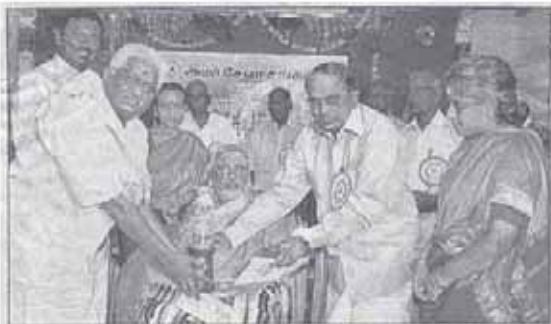
ஆய்க்குடி அமர்சேவா சங்கத்தில் நிறுவன... சமூகத்தின் சேவையை பார்ப்பது அங்குள்ள நெல்லை மையம் ஏதாவது... பார்வையிலிருந்து வருவதில்...