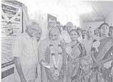
ஆய்க்குடி அமர்சேவா சங்கத்தில் சிறப்பு கல்வி மையம் திறப்பு.

ஆய்க்குடி அமர்சேவா சங்கத்தில் சிறப்பு கல்வி மையம் திறப்பு. இதுவரை கல்வித்தரத்தில் உட்கார்ந்து வந்திருந்த பெண்கள், இப்போது உணவும், தங்கும் விடுதி பெற்றுக் கொண்டுள்ளனர். இதுவரை கல்வித்தரத்தில் உட்கார்ந்து வந்திருந்த பெண்கள், இப்போது உணவும், தங்கும் விடுதி பெற்றுக் கொண்டுள்ளனர்.