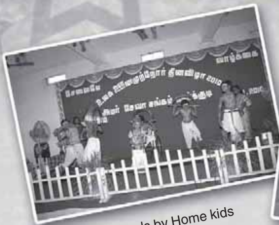
Culturals by Home kids