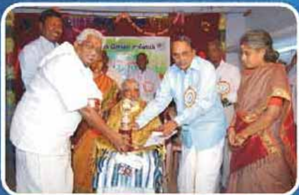
Madura Mamanithar Award