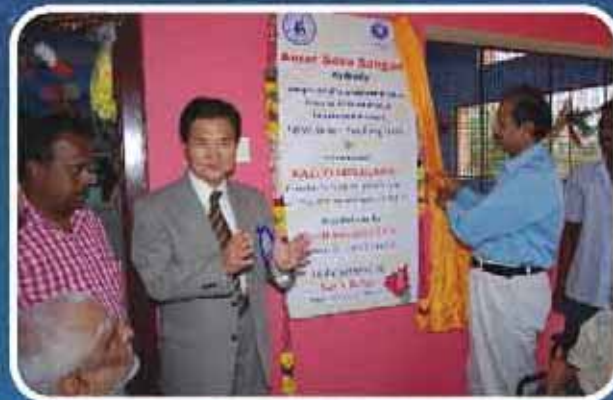
Inauguration of Barrier free dining hall