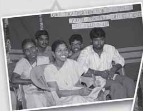
Get together programme for Disabled Youth Trainee Students