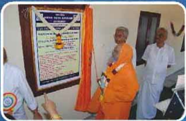
Inauguration of Centre for Special Education